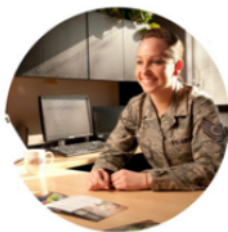
INITIAL ELIGIBILITY REQUIREMENTS